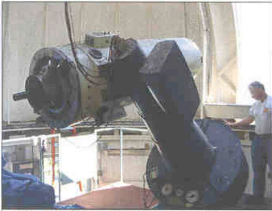
Boller & Chivens 24" Cassegrain Telescope

Greater Cedar Rapids and Linn County have a unique opportunity to create what will be the premier public astronomy site in Iowa. The centerpiece of this new facility will be a rare and valuable 24-inch Boller & Chivens classical Cassegrain telescope originally installed at the University of Iowa's Riverside observatory and recently gifted to the Cedar Amateur Astronomers (CAA).