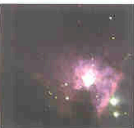
The Orion Nebula

Why is this important to us? We wish to encourage the sciences through hands-on participation in astronomy. There is nothing like seeing the excitement on a young person's face when they see the rings of Saturn or a distant galaxy for the first time with their own eyes.