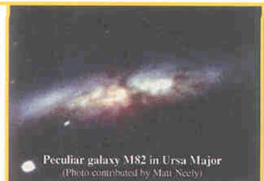
Peculiar galaxy M82 in Ursa Major

"To offer Eastern Iowa an unparalleled opportunity to promote interest and education in the science of astronomy"